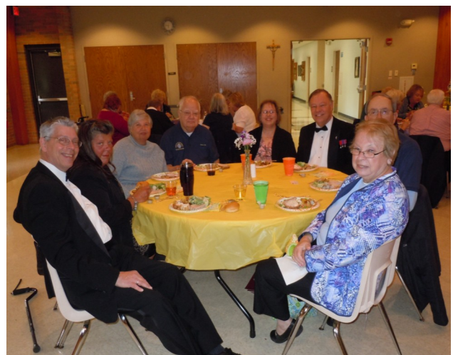
Brother Knights and spouses enjoy fellowship at the Memorial Mass dinner May 31 in St. Scholastica's Activity Center.